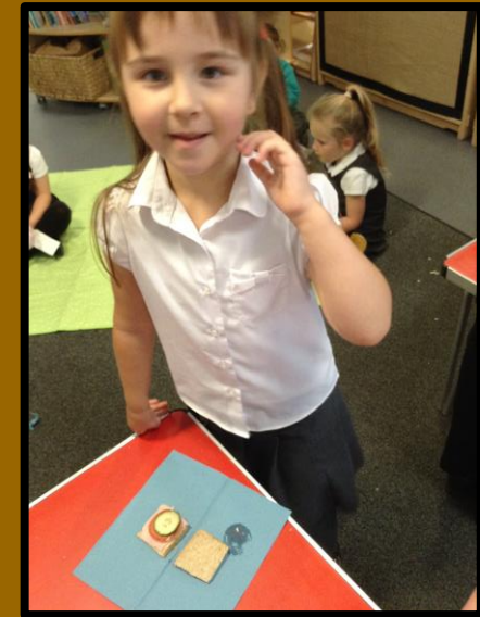
Can you see what they put in? Was it healthy?