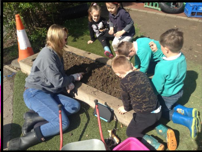
Everyone was busy...