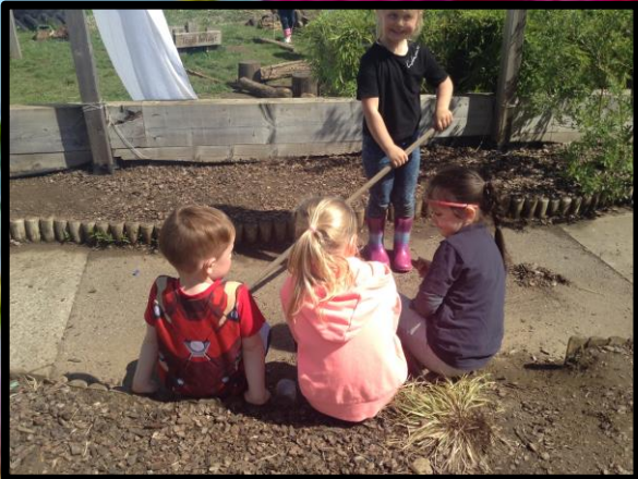
...well almost everyone!