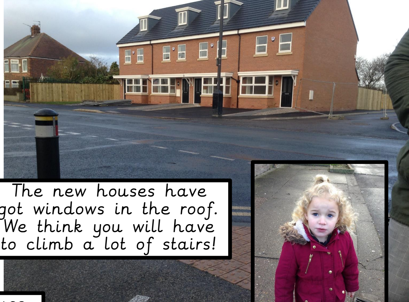
The new houses have got windows in the roof. We think you will have to climb a lot of stairs!