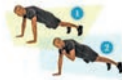
Plank shoulder touch