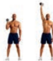
Single arm dumbbell press