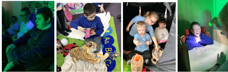
World Book day 2023

Our well-stocked school library promotes authors and a range of reading material to appeal to all pupils. Children's suggestions for new books are encouraged and purchased.