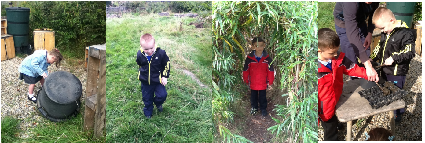
We have been exploring the 'Forest School'. We made mud pies, hunted for mini beasts and went on a nature walk.