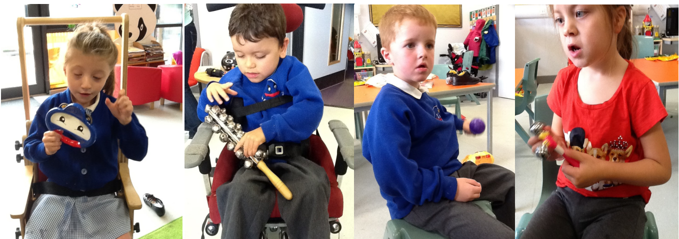
In music we sang songs and used music to join in with the tune.