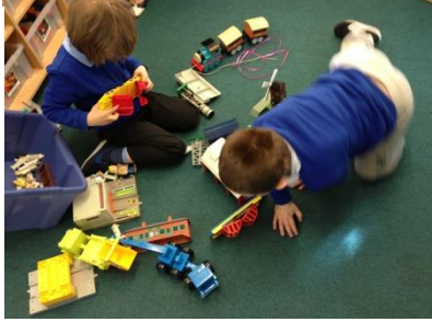
Playing games and taking turns with our friends.