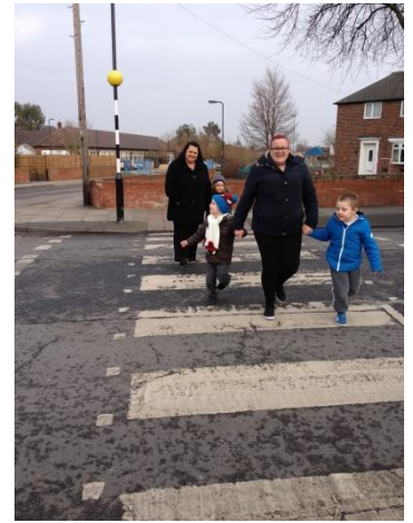
Learning about road safety when we are on our walks out into the community.