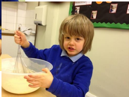
Enjoying some cookery, we baked some cakes.