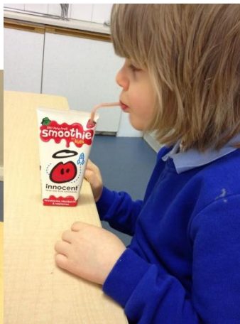
We really enjoy trying new foods and drinks, trying smoothies was our favourite.