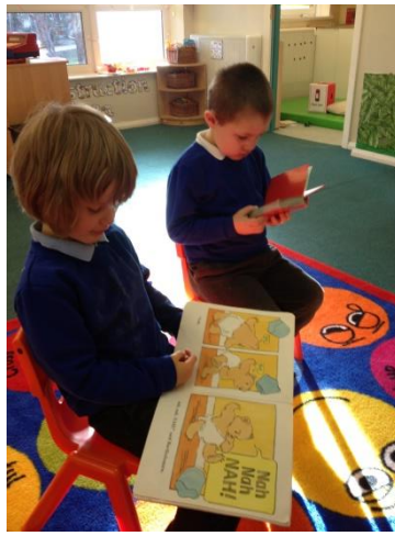
Reading time together.