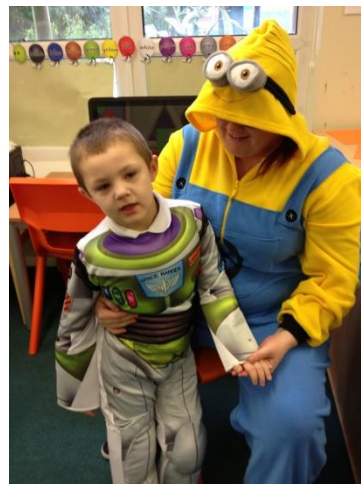
World Book Day fun!