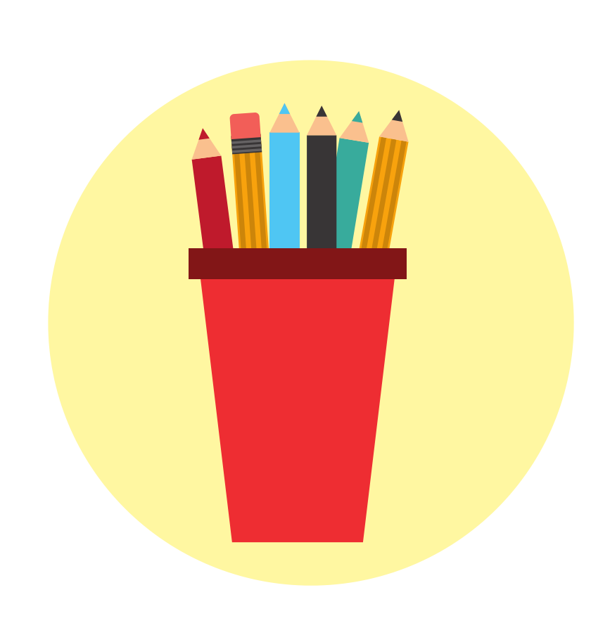
PLAY A GAME CREATE SOME ART BAKE A CAKE