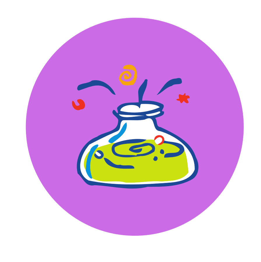
TRY AN EXPERIMENT