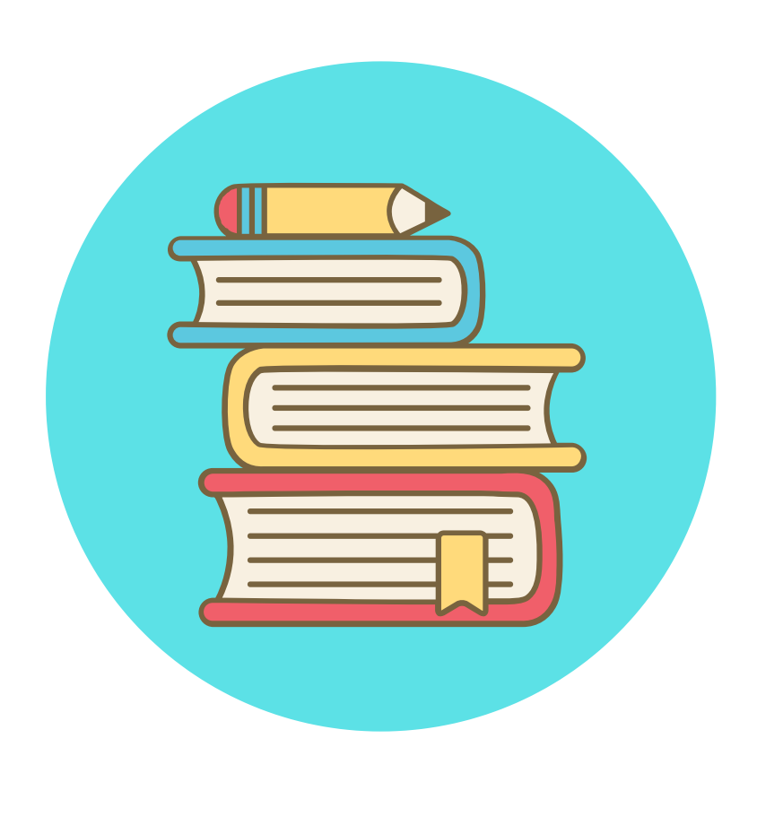
READ A BOOK OR WRITE A STORY