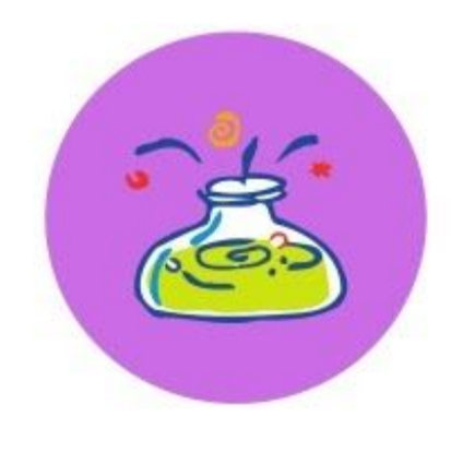
TRY AN EXPERIMENT