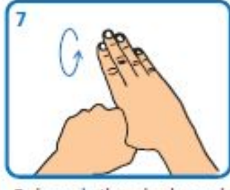
Rub each thumb clasped in opposite hand using a rotational movement