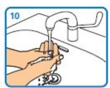
Rinse hands with water