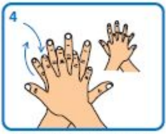
Rub back of each hand with palm of other hand with fingers interlaced