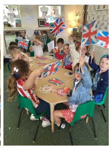
We hope you have a fantastic half term break, and we look forward to our final exciting term in Reception.