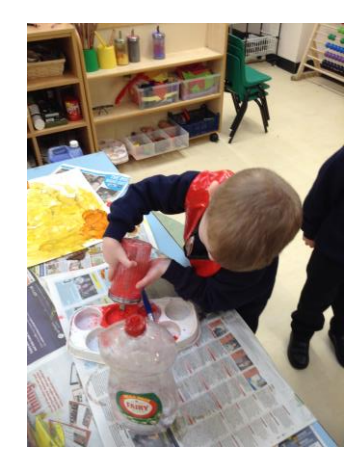
Independence is an important skill for young children to develop.

For safety reasons, a child should be brought to and from the Nursery by a responsible adult NOT an older pupil at the school. Please tell us if someone other than a parent or guardian is coming to collect your child, so that we know they are being taken home safely. The Nursery operates a password system to ensure safety at the door - your password will be decided upon at your home visit.