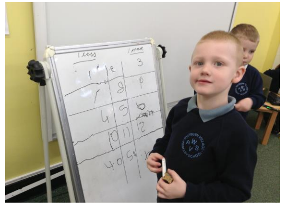
Proud of our work.

We have consolidated our knowledge of "one more" and "one less". Here the boys work together on the white board to find "more than" and "less than" their number.