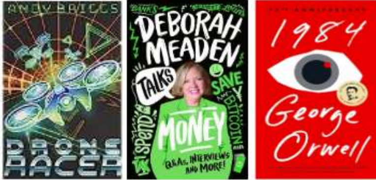
"Drone Racer" by Andy Briggs (Y7) "Deborah Meaden talks Money" (Y8) George Orwell - "1984" (Y9)

We had more successful KS3 Online Book Groups this term. Pupils and parents from year 7, 8 and 9 all met online during the last Monday of term to discuss their chosen books: "The Goldfish Boy" by Lisa Thompson (year 7), "Written on the Stars" by Lois Lowry (year 8) and Front Lines by Michael Grant (year 9). Once again, the groups engaged with some excellent, insightful discussions about the character, structure and themes of the texts. It was a real pleasure to hear such a lovely range of comments, and for pupils (and parents!) to read something that otherwise, may not have been on their radar. It's always good to read out of your comfort zone! Next term, the book groups will meet to discuss the following books: