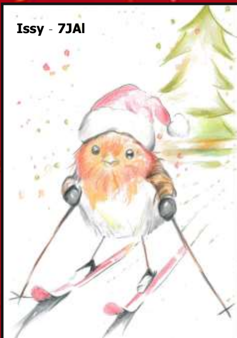
Issy - 7JAI