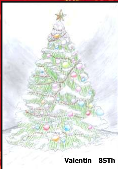
Valentin - 8STh