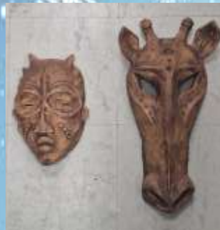
Summer 2025 GCSE Art Work (last year's Year 11)