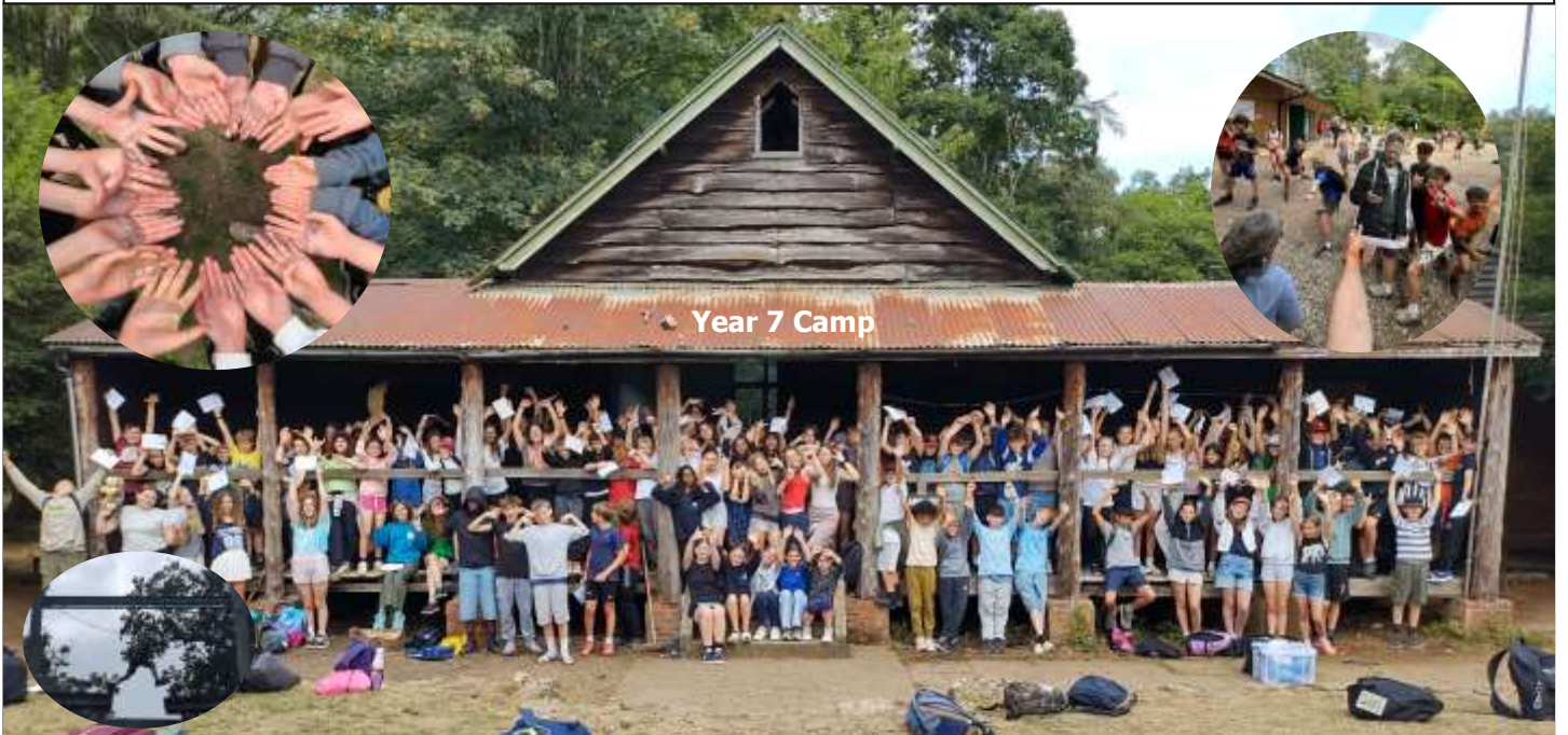
Year 7 Camp