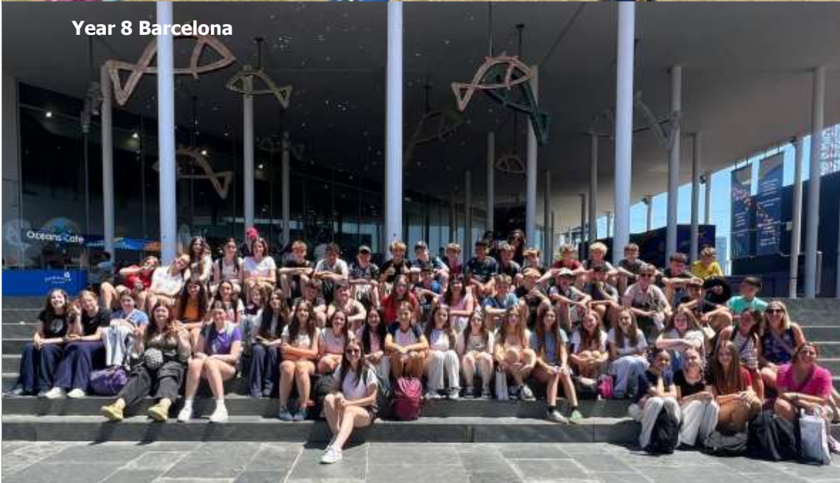
Year 8 Barcelona