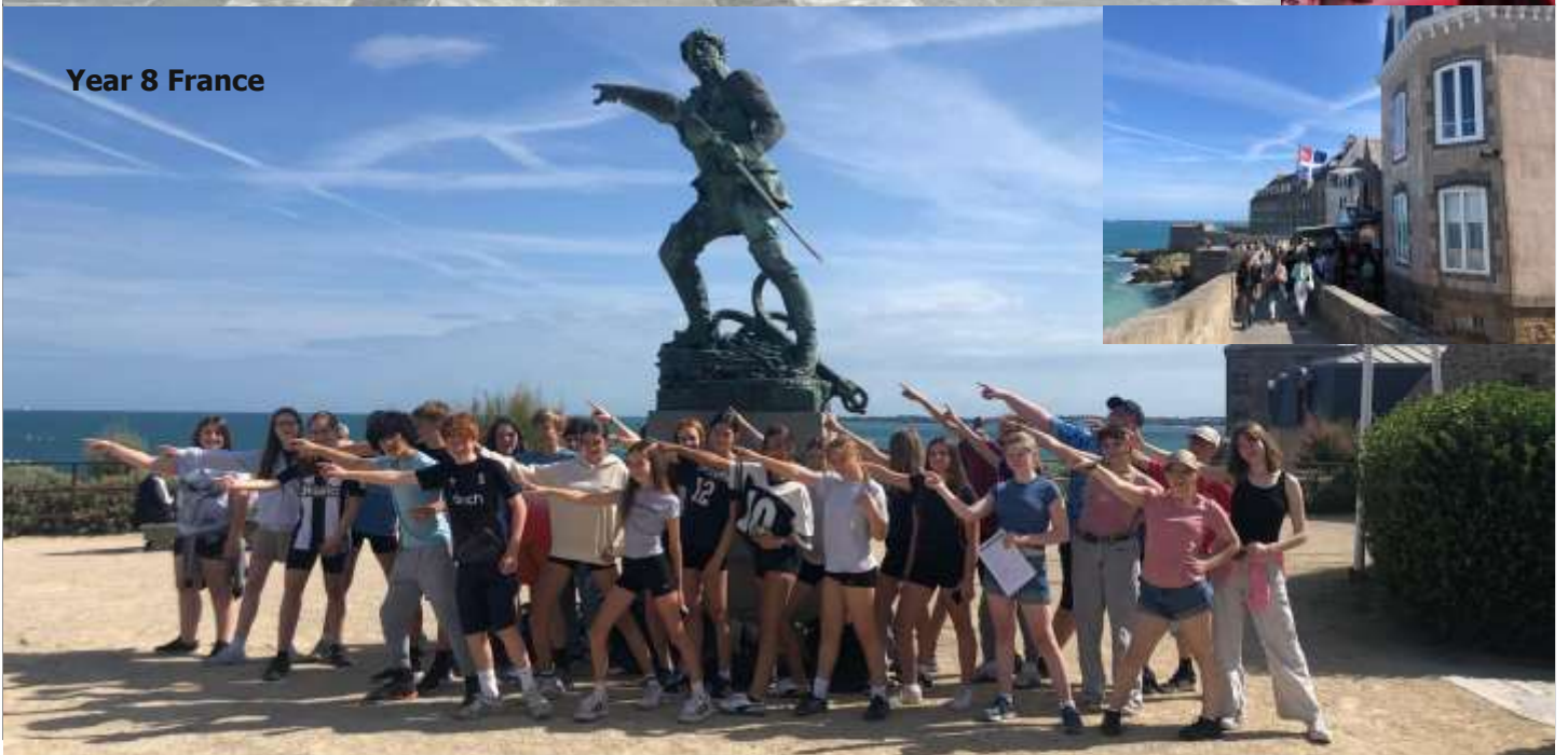
Year 8 France