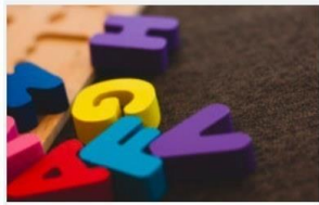
Speech and Language.