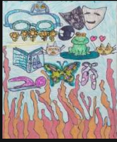
KS 3 Art Sketch Book Covers