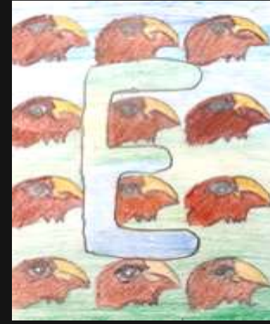
KS 3 Art Sketch Book Covers