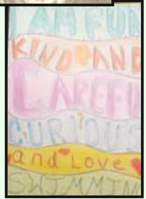
Examples of Year 8 Portraiture/Identity; tonal self portraits leading towards mixed media/watercolour painting outcomes based on Identity (currently underway), influenced by Chris Ofili's "No Woman No Cry"