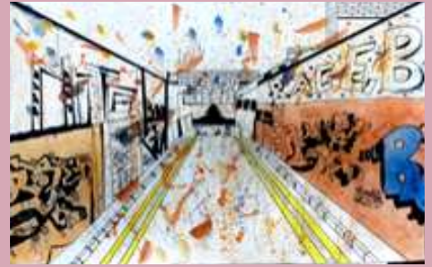
Year 9 Art—Exploring Perspective (and page 1)