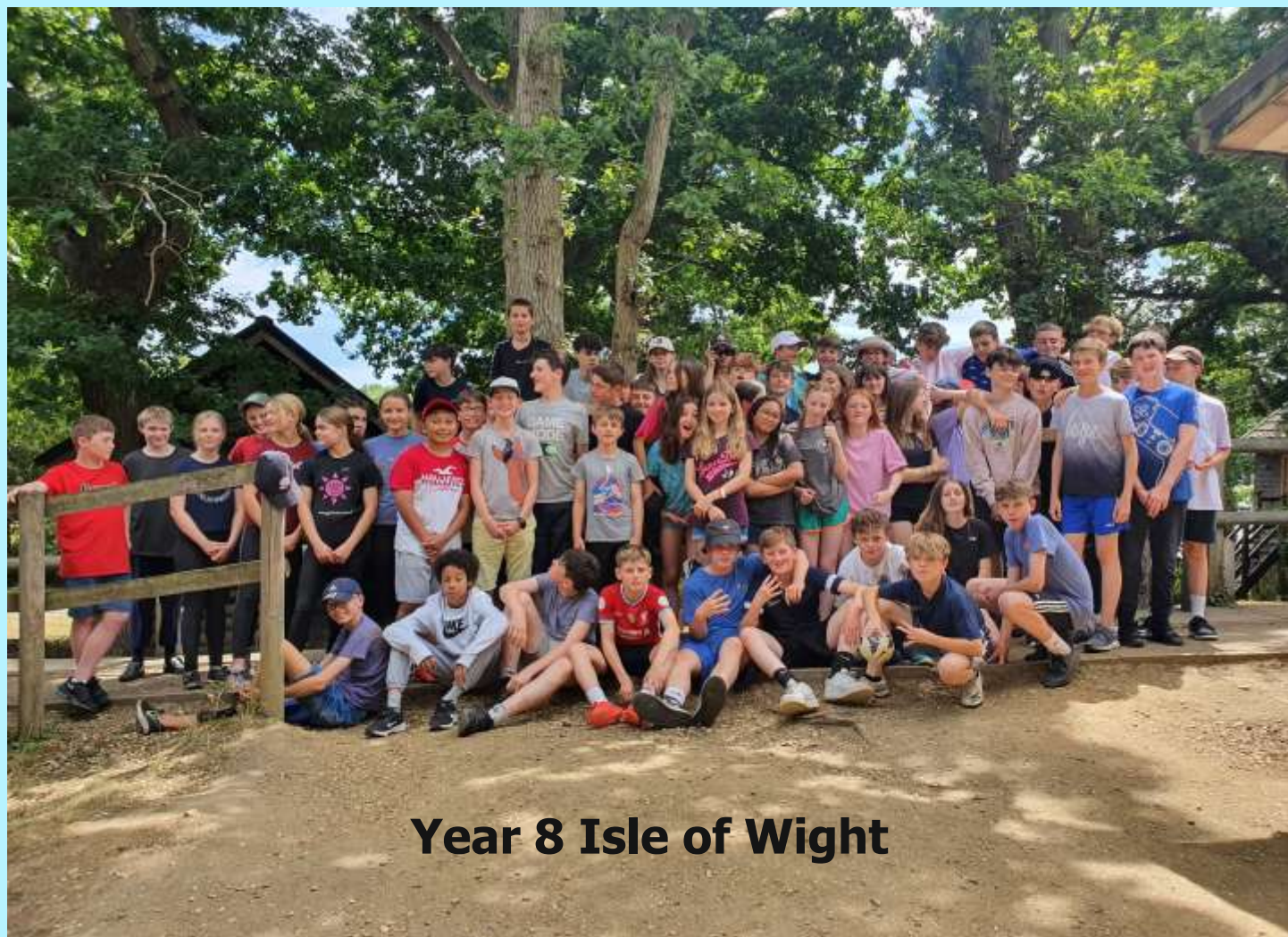
Year 8 Isle of Wight