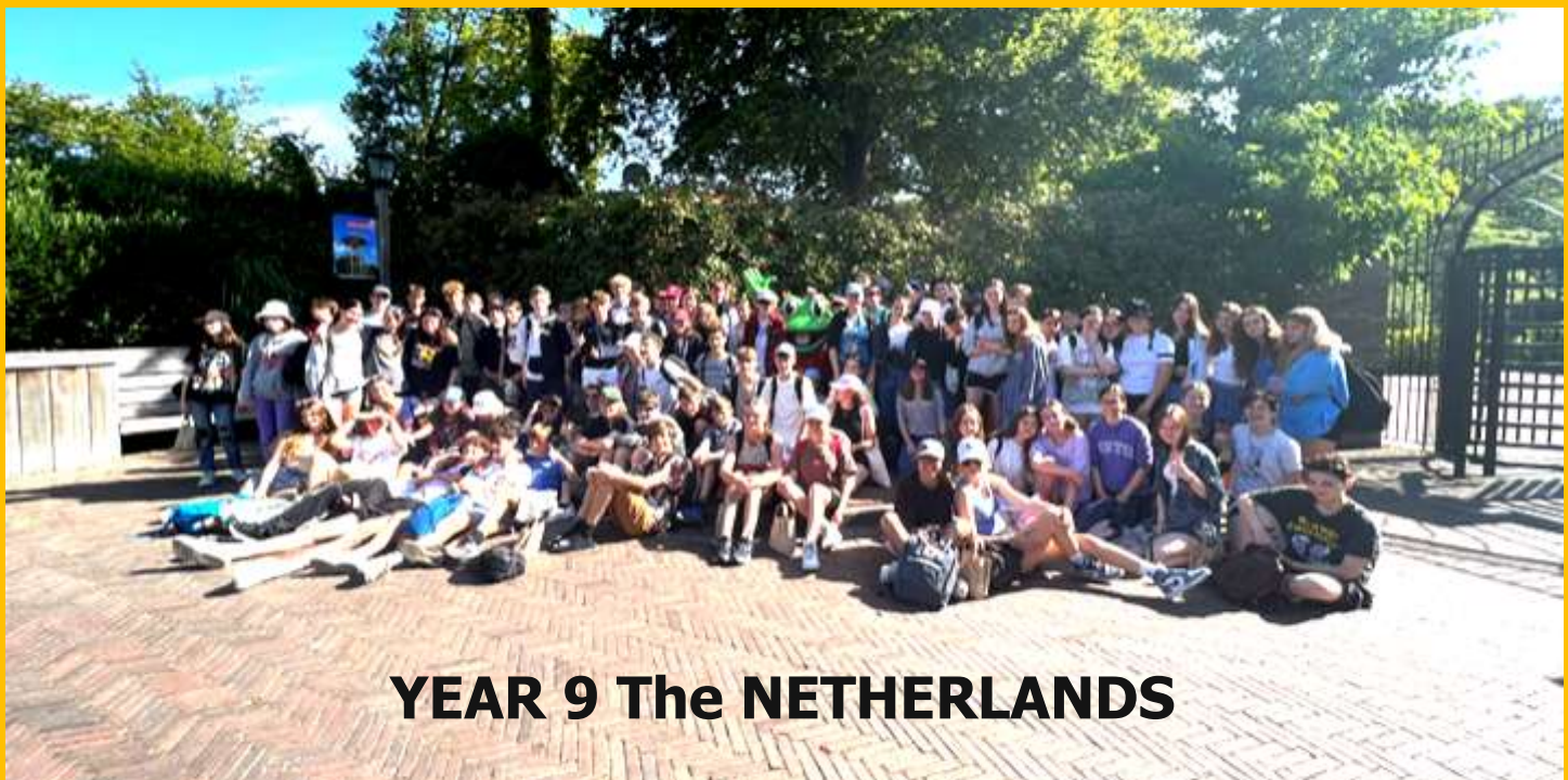
YEAR 9 The NETHERLANDS