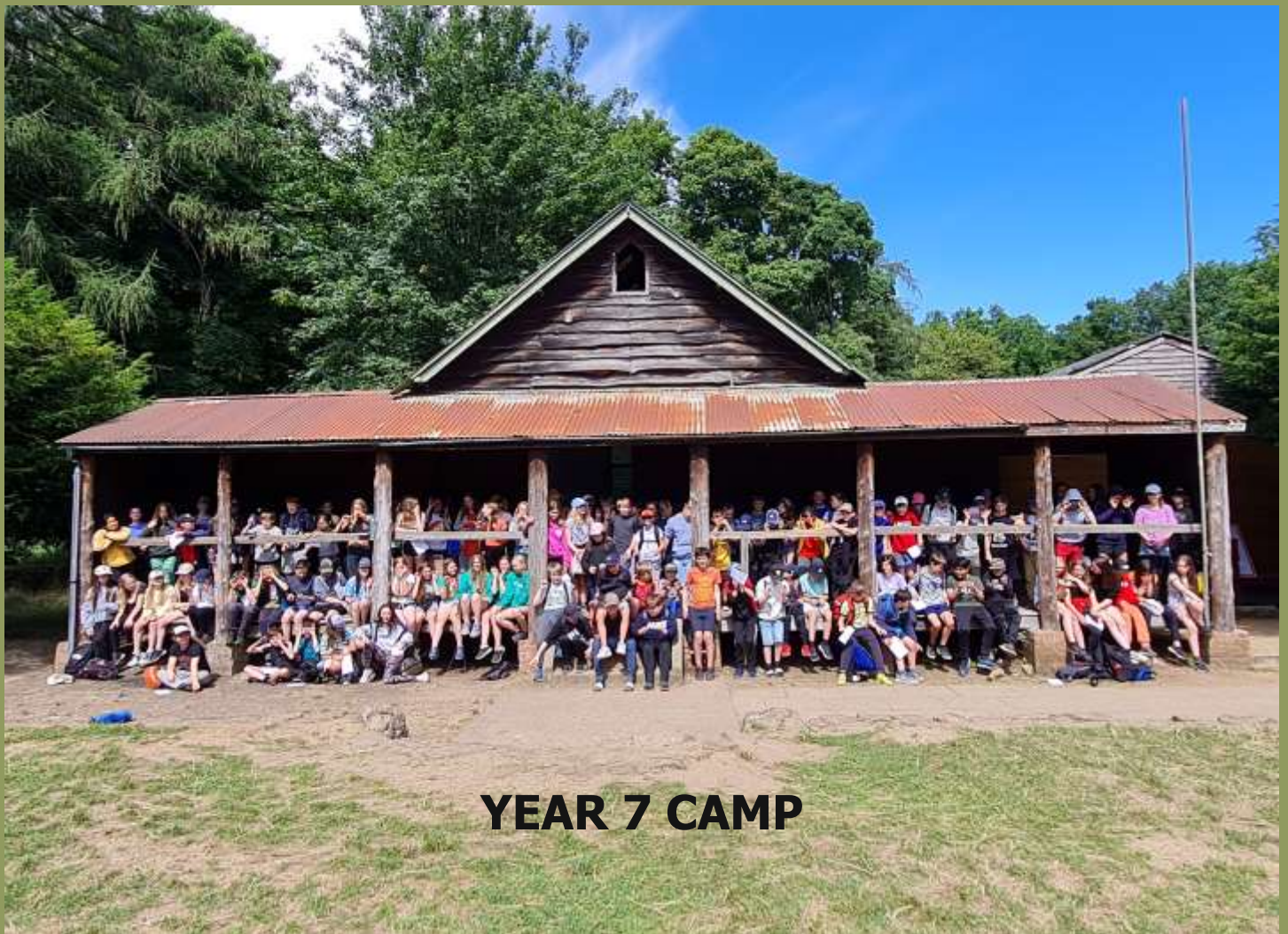
YEAR 7 CAMP