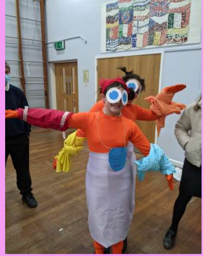
Please check the website for up to date information. www.langtreeschool.com