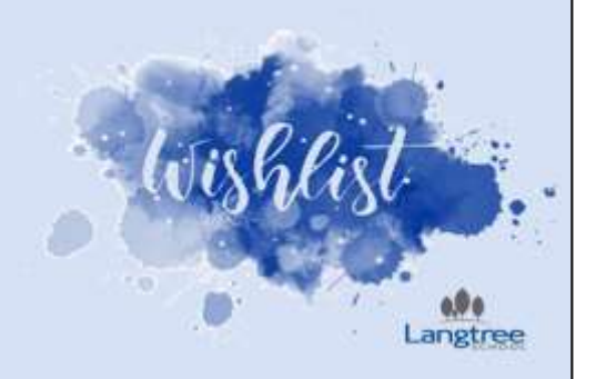
A New Way to Lend a Hand!

Your generous and ongoing help is really making a huge difference. As we approach half term, I would just like to take this opportunity to convey my heartfelt thanks on behalf of us all.