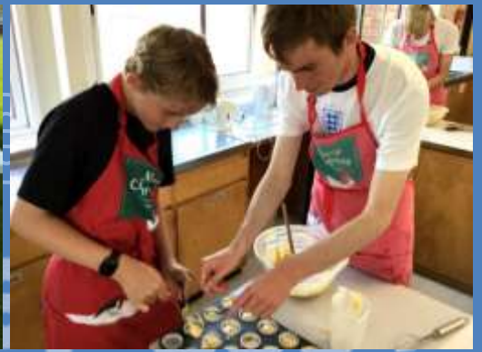
Cake Tapas for the School Production