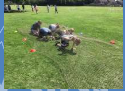
Year 7 Team Building