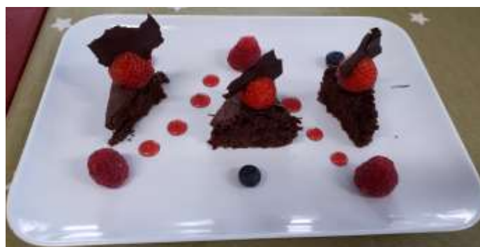
Year 10 GCSE Food Chocolate Brownie plate styling challenge