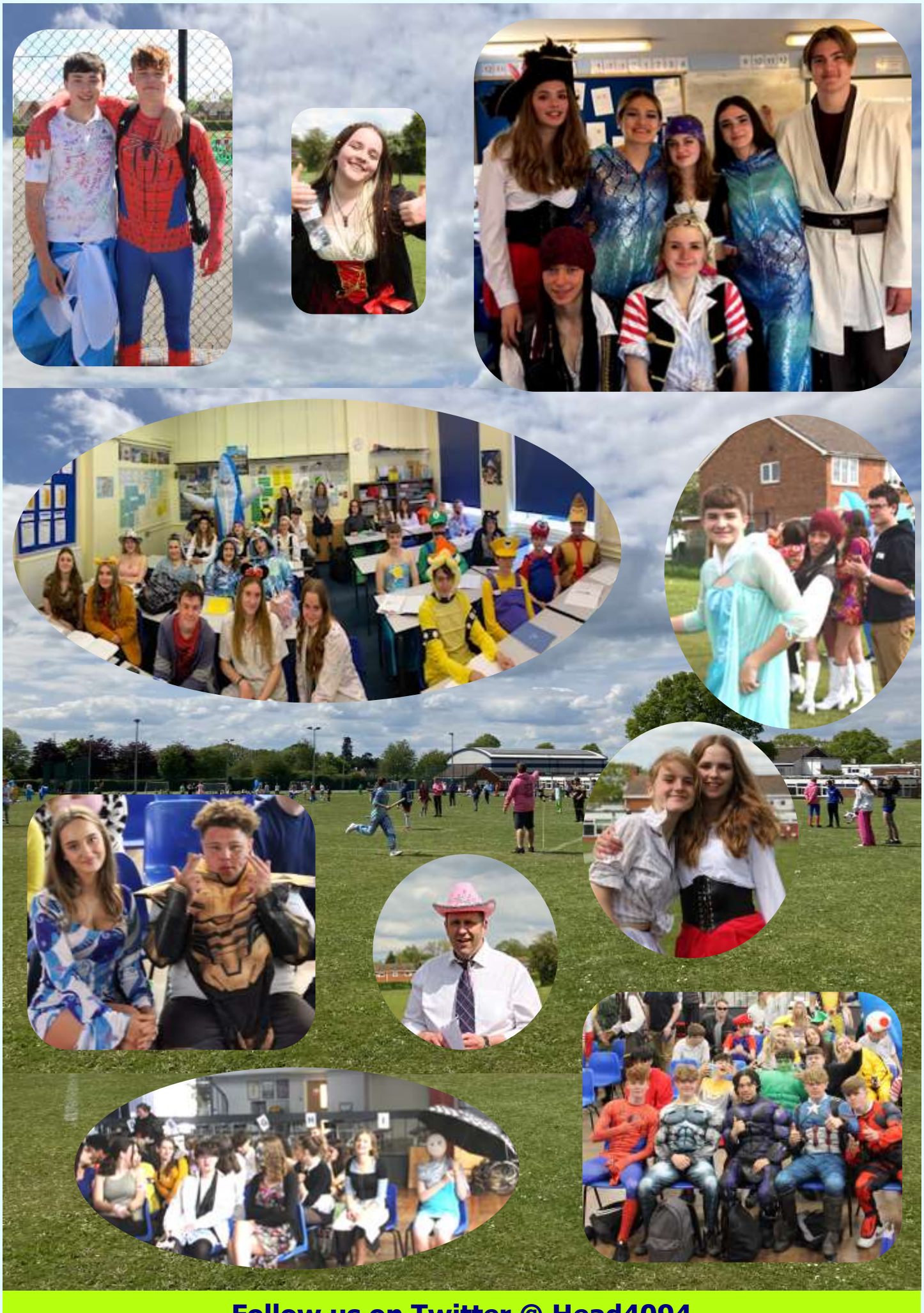
Follow us on Twitter @ Head4094