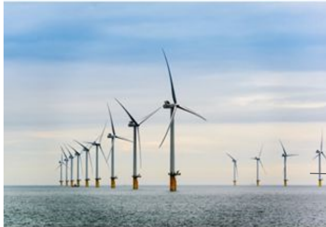
Offshore renewable energy in the North Sea