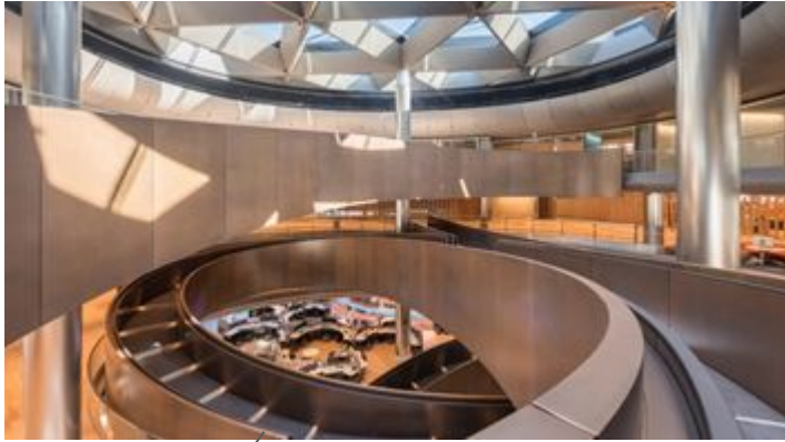
Bloomberg's new headquarters in London