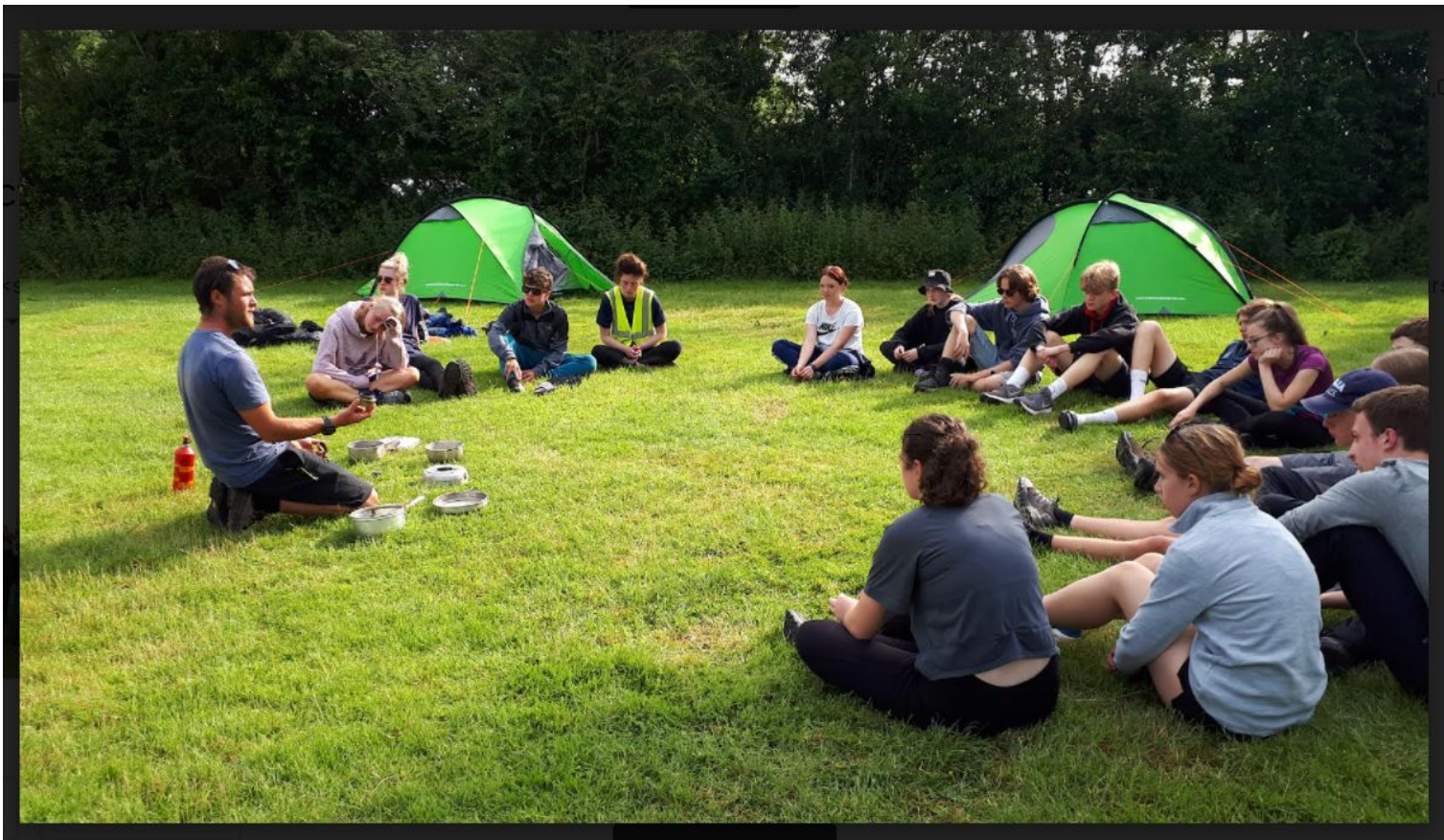
Camp craft and map reading!