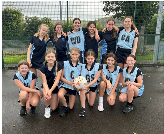
Year 7 Netball Team