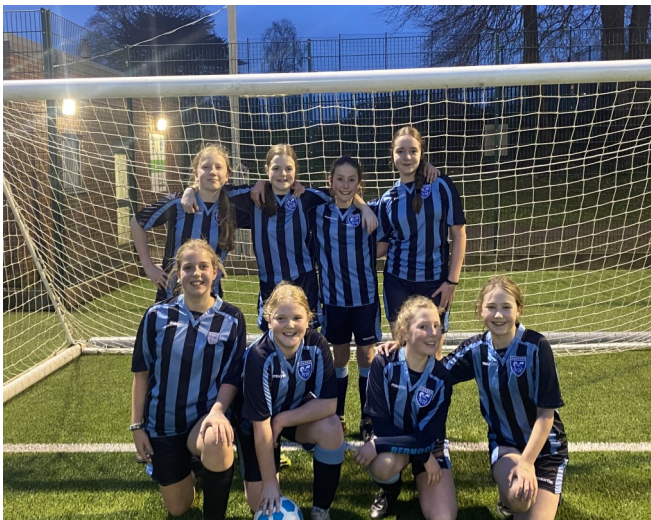
Under 12s Girls Football Team