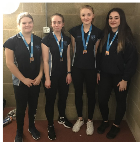
Rednock Girls U16 Badminton Team

The girls played some fantastic Badminton battling throughout every game, representing the school with the highest of standards. Well done girls!