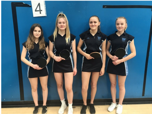
Rednock Girls Under 16 Table Tennis

The Rednock Girls Under 16 Table Tennis team (who were previously successful at the District Level 3 tournament as winners) went to represent the County up in Walsall and finished a creditable 4th place. The competition was extremely fierce and included many club and county players.