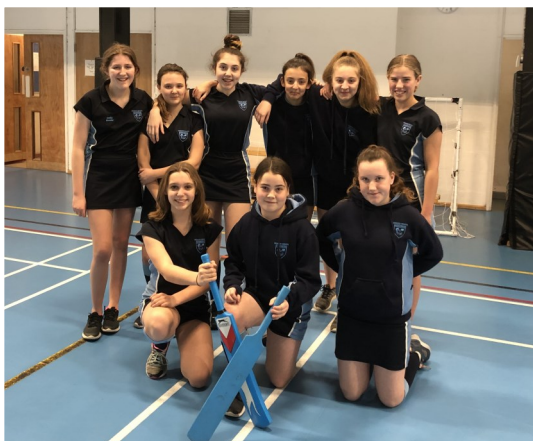
Rednock Girls U13 Indoor Cricket Team