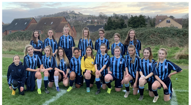
Rednock Girls U14 and U16 Football Team

It was a great afternoon of football with a great team spirit and a wonderful atmosphere between all of the girls.